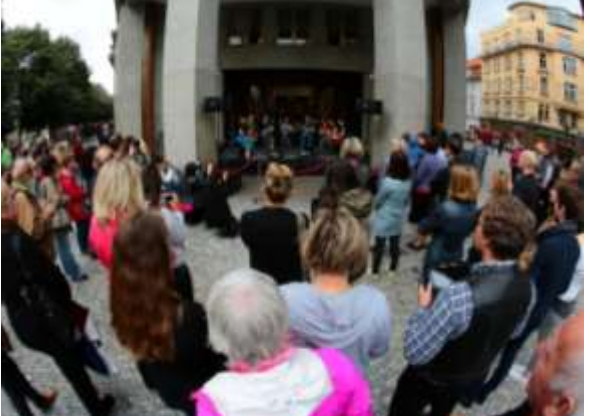
Societe Generale employees with Les Siècles orchestra in La Défense headquarters in 2015