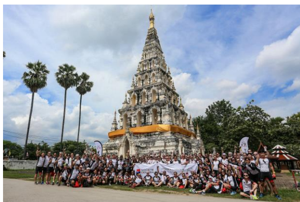
Asia Bike Ride, Thailand, October 2017