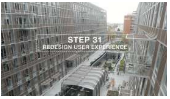
Click on the picture above to view the video about STEP 31

This is the case for STEP 31, the Group's first internal startup, which was set up in July 2016 to enhance the digital workplace user experience for Societe Generale employees.